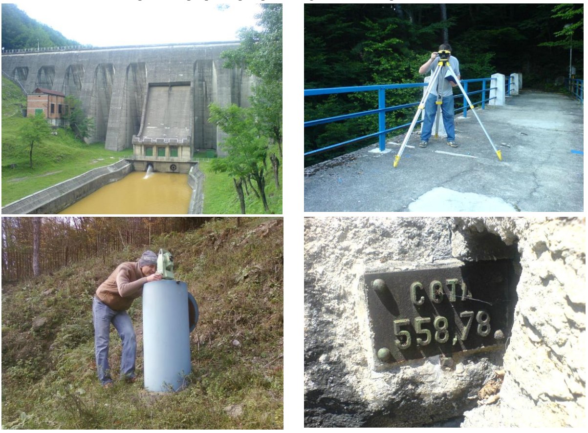
Complex surveying on Valiug, Timis-Trei Ape, Secu, and Gozna dams (Banat region) necessary for 2009 Report