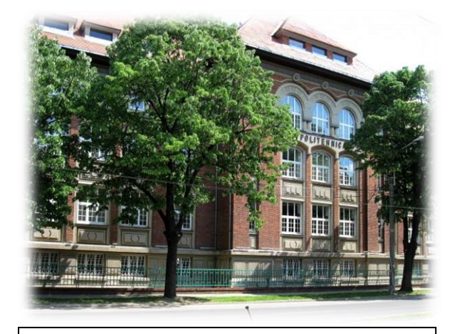
Faculty of Mechanical Engineering