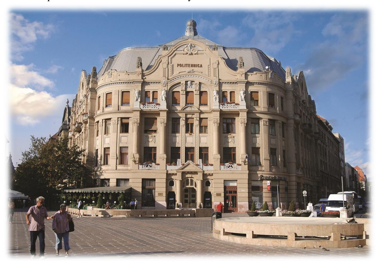
The Rectorate of Politehnica University of Timişoara

During its century long existence, Politehnica University of Timişoara enriched its academic offer by adding new fields of study, developed an educational and research infrastructure comparable with the most prestigious European universities, and produced 131027 specialists, greatly appreciated on the national and international level for their competence. The students of Politehnica University of Timişoara have at their disposal a modern campus with all the facilities required for a successful academic stay.