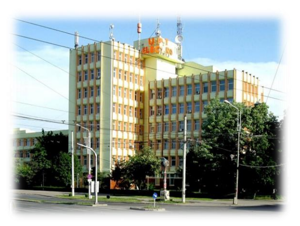
Faculty of Automation and Computers Faculty of Electrical and Power Engineering Faculty of Electronics, Telecommunications and Information Technologies