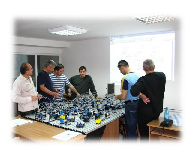
Department of Mechatronics