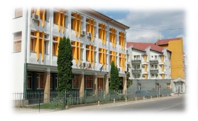
Faculty of Engineering in Hunedoara