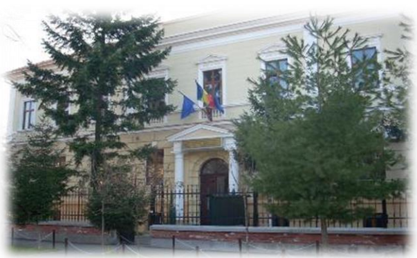
Faculty of Management in Production and Transportation