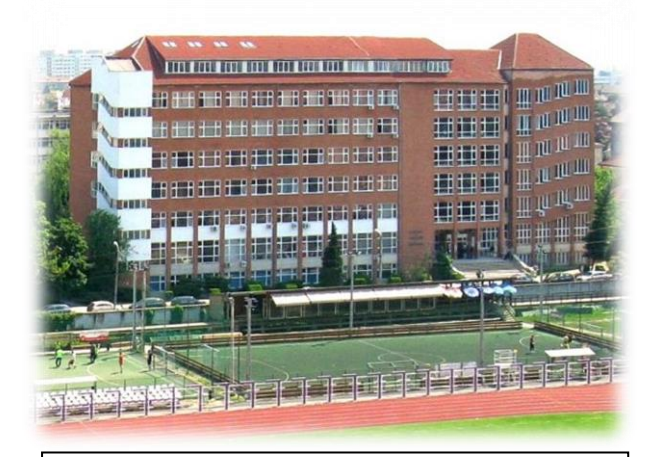
Faculty of Architecture and City Planning Faculty of Civil Engineering, Faculty of Communication Sciences