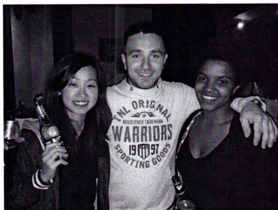
Taiwan, Serbia, France

The Buddies will organize a lot of stuff for international students (Welcome day, Present your country...). These events are made only for Erasmus students, so you are going to meet a lot of people from all around the world.