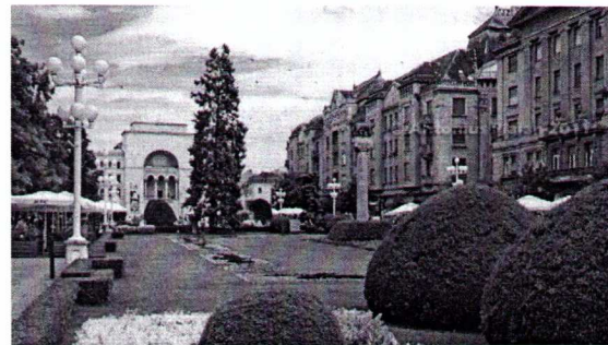
Timisoara main square