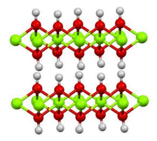
Figure 1. Crystalline structure of brucite [7]

Layered double hydroxides are based on the brucite structure- Mg(OH)_2 (Figure 1) [7]. The octahedral circumference of each Mg^{2+} cation with 6 OH<sup>-</sup> ions is observed, respectively the generation of two-dimensional layers starting from the edges of the octahedra.