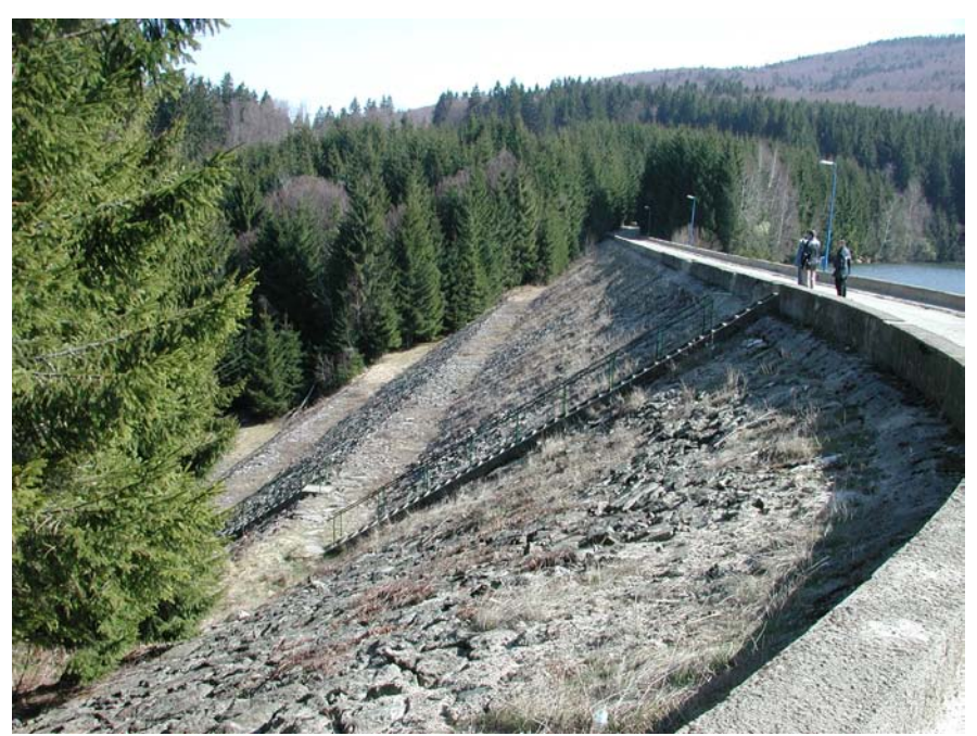
Studies regarding the dams safety running